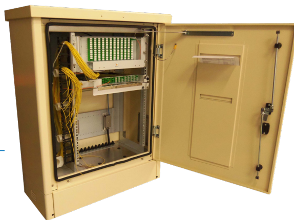
GRL009172A (FTTH G2 SP 1x15U D350 - PM100)

GROLLEAU propose an 1x15U single skin SRO outdoor cabinet 350 mm depth to connect houses in moderately dense areas . Cabinet is full removable and reassemblable, without service interruption .