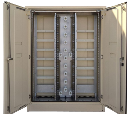
GRL010085A (FTTH G2 SP 2x40U D500)

Aluminium single skin cabinet has a door, a roof, baseboards and removable panels from the inside , easily replaceable.